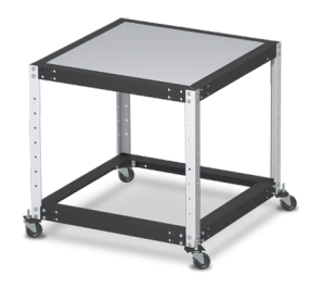
SI-27 Stand for D-100